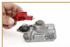
Step 10: Assemble the diaphragm, spring and new ALJ cover on to the float bowl correctly.