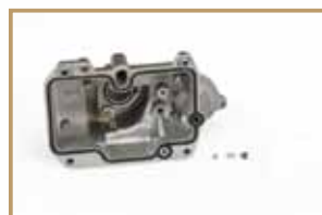
Step 9: Drive the ball, small spring and plug out the check valve and clean the float bowl thoroughly.