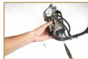
Step 4: Pull down the pushrod.