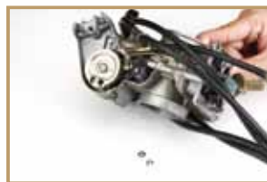
Step 3: Disconnect the black plastic linkage arm from the pushrod.