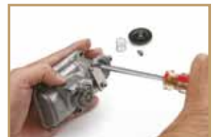
Step 4: Secure the supplied drill fixture to the float bowl with 2 original screws of the diaphragm cover.