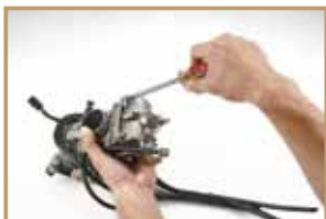
Step 1: Detach the carburetor from your bike and then remove its float bowl.