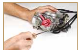
Step 12: Assemble back the float bowl on the carburetor.