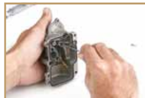
Step 7: Install the new supplied leak jet and plug back.