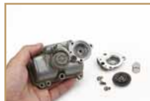
Step 3: Remove the stock diaphragm cover and keep the diaphragm, spring and 3 diaphragm cover screws aside.