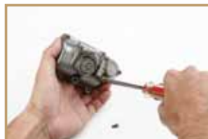
Step 2: Loosen the 3 diaphragm cover screws from the float bowl.