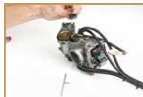
Step 5: Remove the black plastic linkage arm and the original accelerator pump spring.