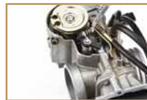
Step 7: Reinstall the black plastic linkage arm making sure the end of the APS is sitting on its correct shoulder.