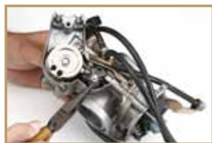
Step 2: Remove the E clip out of the groove with a long nose pliers.