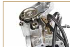
Step 6: Install the APS with the U shape end inwards and pointing down, and then rotate the APS counter clockwise until it contacts the steel arm.