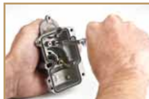
Step 6: Turn over the float bowl and remove the original leak jet.