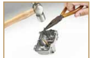
Step 8: Use the shank end of the drill bit for driving out the check valve in the float bowl.