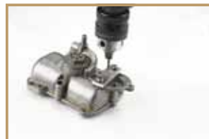
Step 5: Drill a hole through the float bowl with the 2mm drill bit supplied.