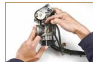
Step 8: Push back the pushrod and be sure the pushrod ball is in its socket and the E clip is installed with its sharp edge facing outwards.