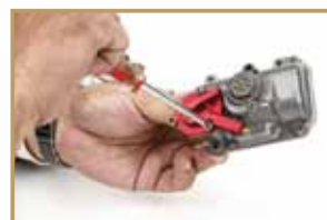
Step 11: Tighten back the 3 screws to new ALJ cover.