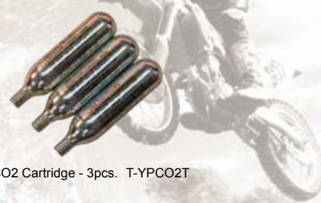
CO2 Cartridge - 3pcs. T-YPC02T