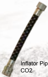
Inflator Pipe CO2